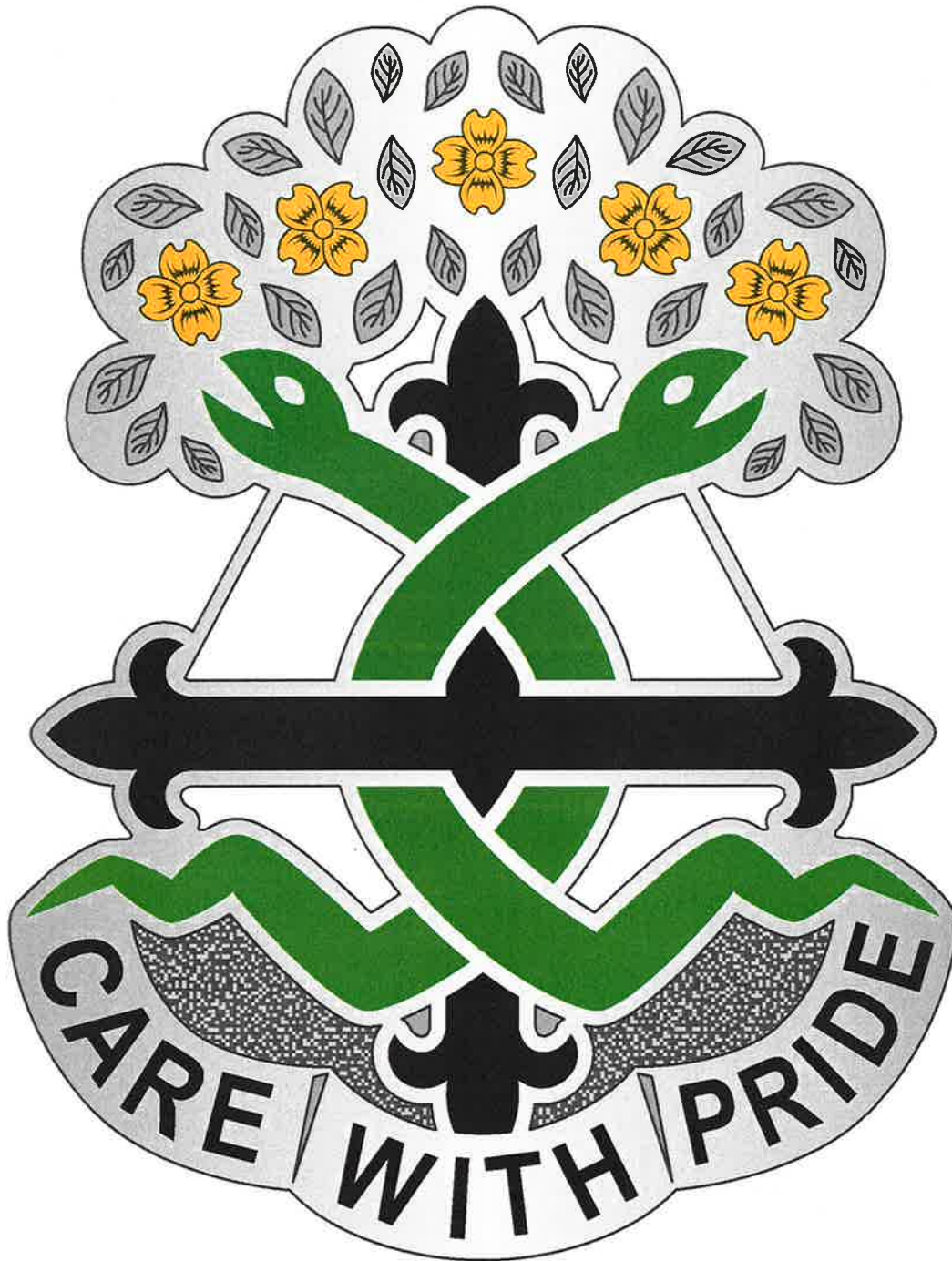
SIX TIMES SIZE