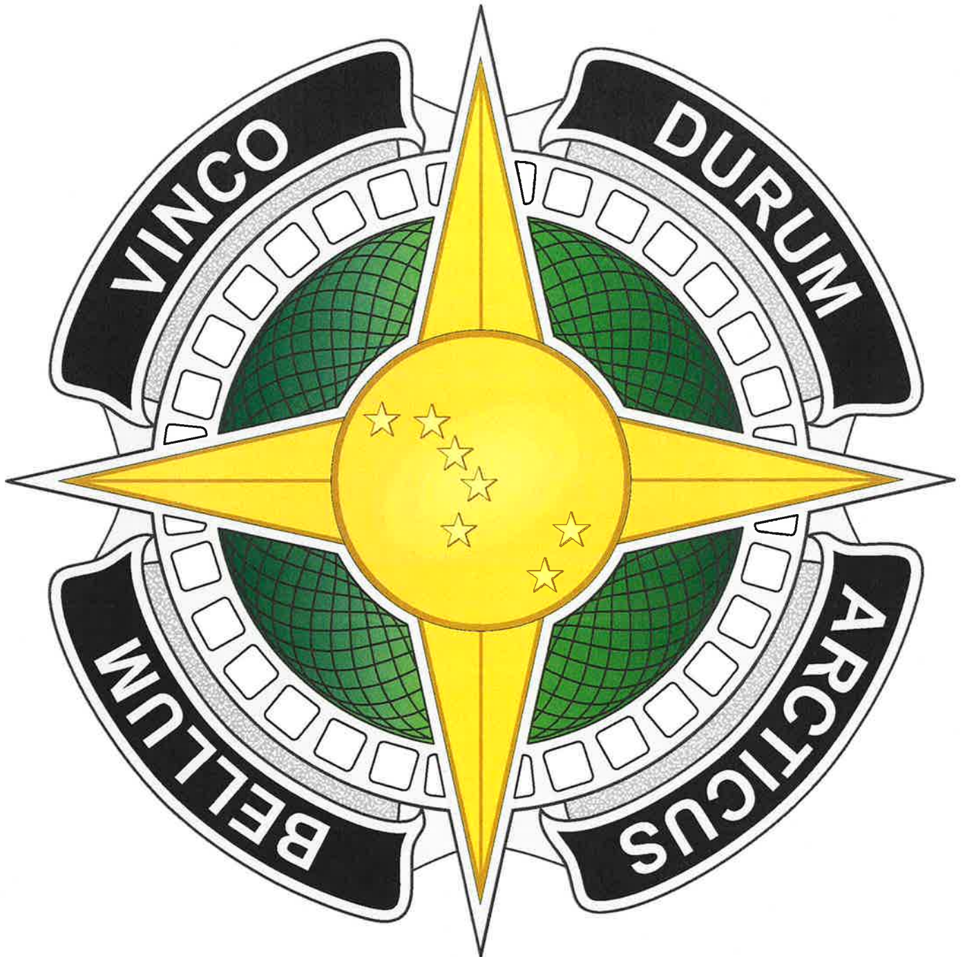
SIX TIMES SIZE