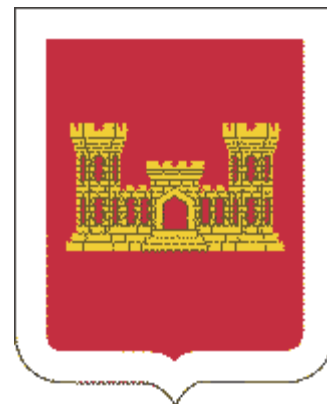
Regimental Coat of Arms

Branch Insignia: A gold color triple turreted castle eleven-sixteenth inch in height.