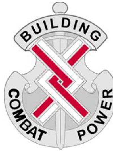
Distinctive Unit Insignia