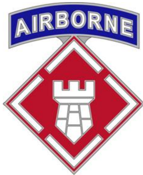
Combat Service Identification Badge With Tab